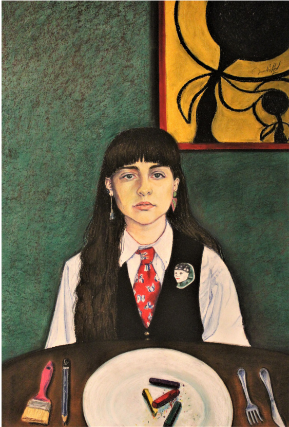
Self Portrait: The Starving Artist 30" x 45" Pastel on paper, 2019.

2020 Undergraduate Scholarship Award Recipient Medicine Hat College, Bachelor of Fine Arts Program, University Studies. Cello Student Medicine Hat College Conservatory (Ongoing).