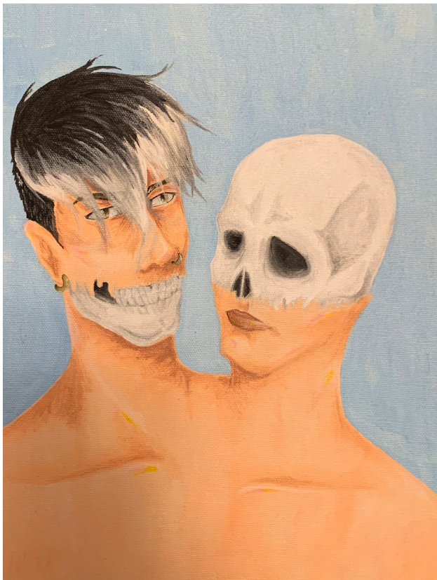
Skull Girl VII 9" x 12" Acrylic on canvas, 2019.

When I was six years of age, my mother introduced me to a community art class where I was mesmerised by the use of a pencil and began drawing images that came from my imagination. It was a moment where it felt as if I was holding a wand and letting the magic do the work for the first time. By the time I was at Luther College High School from 2011 to 2015, I studied Advanced Mathematics and Art to challenge myself through painting, drawing, and craftsmanship. In my final year of High School, I became interested in pop culture and began experimenting with oil paint, pencil crayons, and digital design using programs like Photoshop. Most of my artworks are influenced by both western and eastern cinema and television. I am also influenced by the cultures of other countries such as Chile, Mexico, Germany, Italy, and Turkey. I began drawing images on papers and canvas, but then transferred designs on to unwanted objects such as shoes, empty bottles, recycling materials, and more. I explore my creativity and hone my skills by using/reusing items and experimenting with Pop Art.