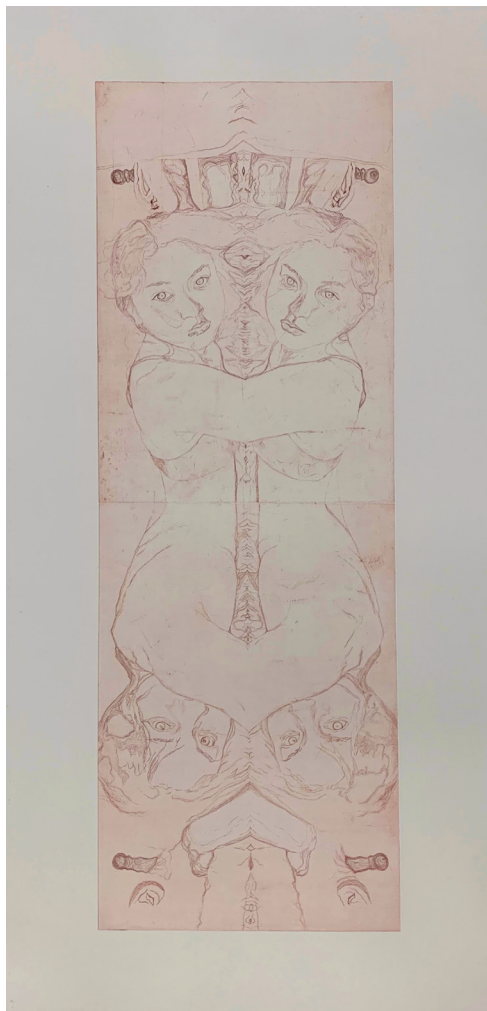
Binulan 26" x 42" Copper Etching on Hahnemuhle paper, 2019.

Most of my works are derived from the expressive nature of the psyche, they are intuitive and self-reflective. This body of work is also highly influenced by the rise of mental health awareness in society; dealing with mental issues is not easy. Through my work I try to tackle my own anxieties and depression to overcome these issues and in some way help others who may also be going through the same struggles.