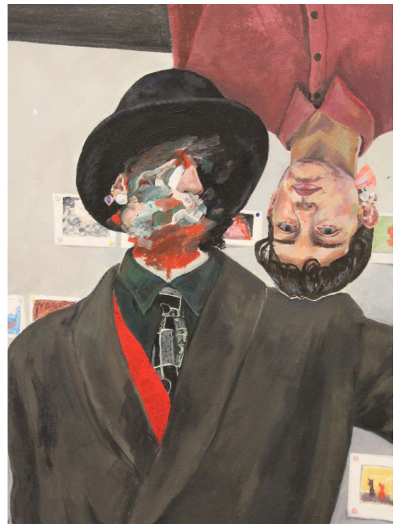
Painting: Self Portrait 20" x 26" Acrylic on canvas, 2019.

The idea is that I am eating art supplies, a symbol for choosing to be an artist despite being unsure of my financial stability as one. The yellow square above me depicts the silhouette of a painting I made when I was much younger. I drew this by observing a photograph I took of myself.