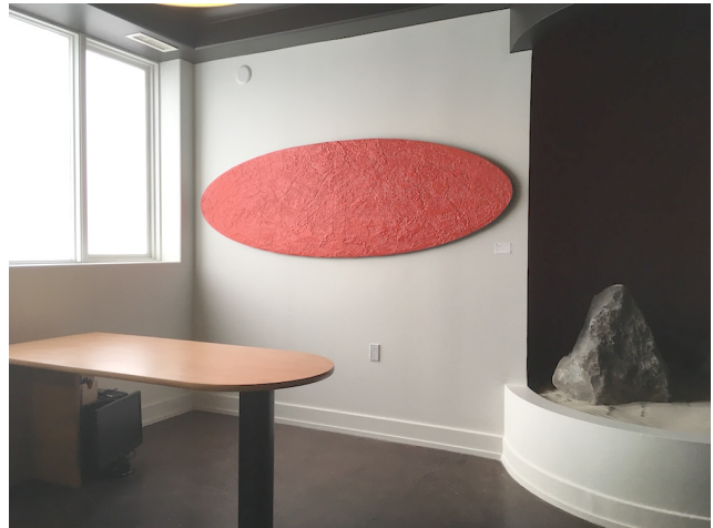
Images above – Installation picture of the TREX exhibition “ Forward and Back ” by Barbara Ballachey.